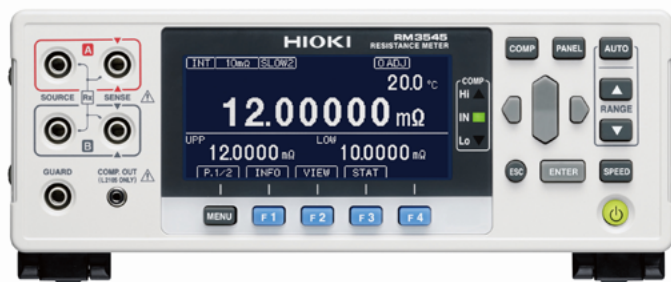
Figure 1: HIOKI RM3545 Resistance Meter

That's why the "smallest" bench resistance meter from HIOKI - the RM3544 - has a lowest resistance range of 30 mOhm. Its "bigger brother", the RM3545 , has a lowest resistance range of 10 mOhm and a resolution of just 0.01 \mu Ohm.