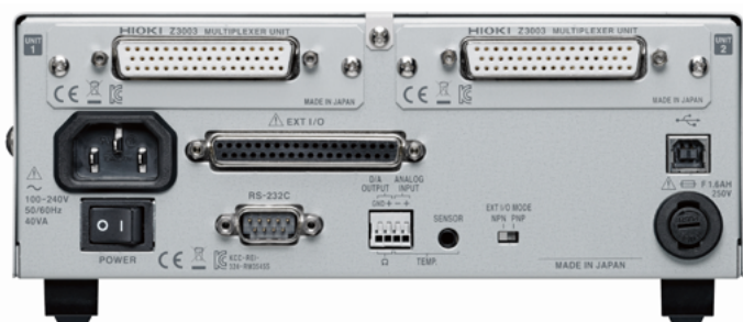
Figure 2: Backside of RM3545-02 (including two Z3003 multiplexer cards)

A very useful function - which is hard to find even in top of the range multimeters - is a contact check function: If activated, a measurement is only started after ensuring that the probe has proper contact to the device under test. This is a feature surely not critical in a lab environment, but really useful in production environments where it helps to avoid rejects caused by poor contact of the probe to the DUT. N.B.: The contact check function is featured in the RM3545 , but neither in the RM3544 nor the RM3544-01 .