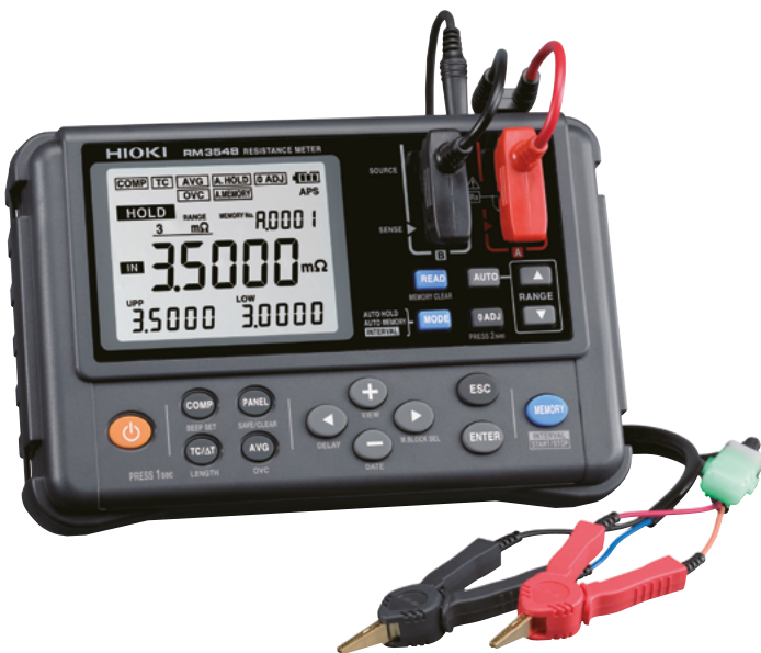
Figure 6: The portable resistance meter RM3548 from HIOKI

The RM3548 doesn't feature a guard terminal, as this portable resistance meter is typically used for lower resistances. Lower resistances mean that predominantly higher measurement cur-