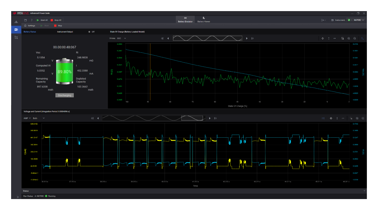
Figure 7. PW9253A creating a battery model with static profile function