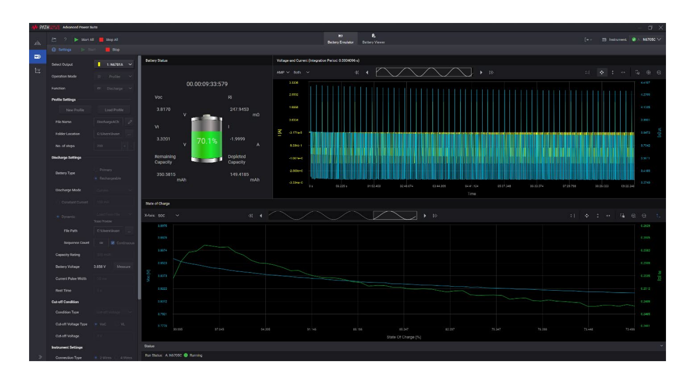
Figure 8. PW9254A creating a battery model with dynamic profile function