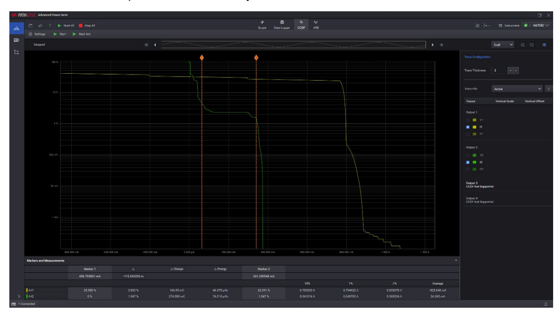
Figure 6. PW9252A in CCDF mode

To help you analyze distribution profiles, the PW9252A software includes a complementary cumulative distribution function (CCDF) <sup>1</sup>. This function provides a concise way to display long-term dynamic random current drain. It is also an effective way to quantify the impact of design changes (hardware, firmware or software) on current flows in your device.