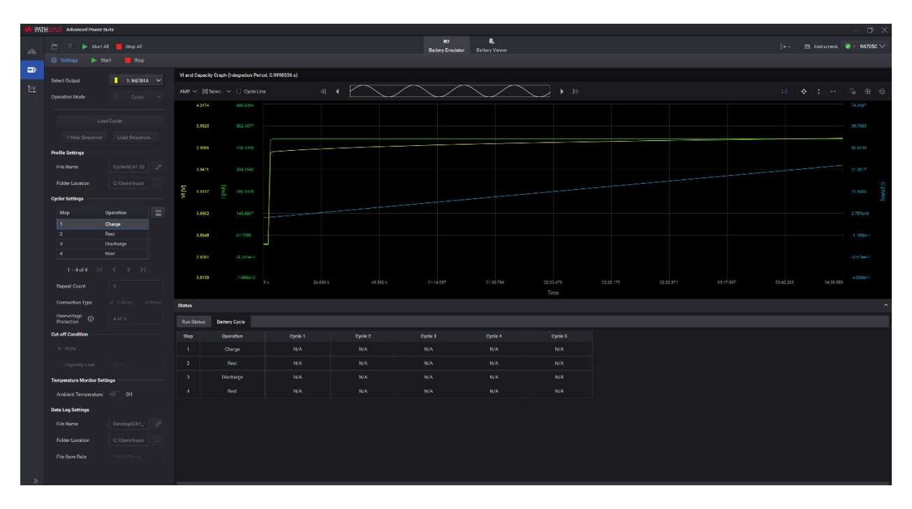
Figure 12. PW9254A Cycle testing a 18650 battery

The cycling function as the flexibility allows you to create a custom sequence of charging, resting, and discharging a battery at various test conditions. The software enables you to make up to 1000 cycle operations on the battery to determine the battery's age effect and reliability under sequence test conditions. While continuously monitoring the battery's health and recording test data parameters of capacity, terminal voltage, current, and time. The cut-off condition features allow you to define a stop condition where cycling will automatically stop once capacity loss percentage is reached.