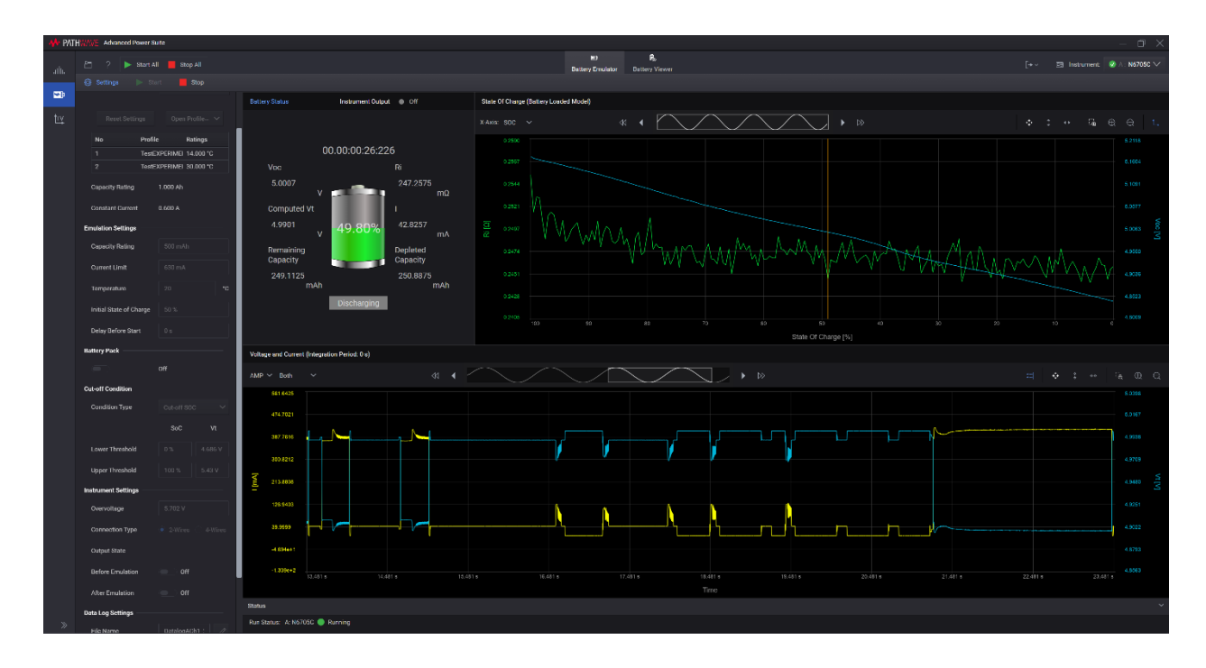
Figure 11. PW9254A Emulating multiple battery models at different temperatures