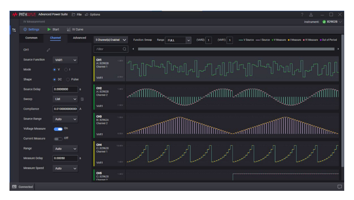
Figure 1. Previewing the settings of multiple SMU channels

The setup menu allows you to specify and preview the settings on multiple SMU channels before you perform a measurement, giving you the flexibility and ease of setting up the SMU channels.