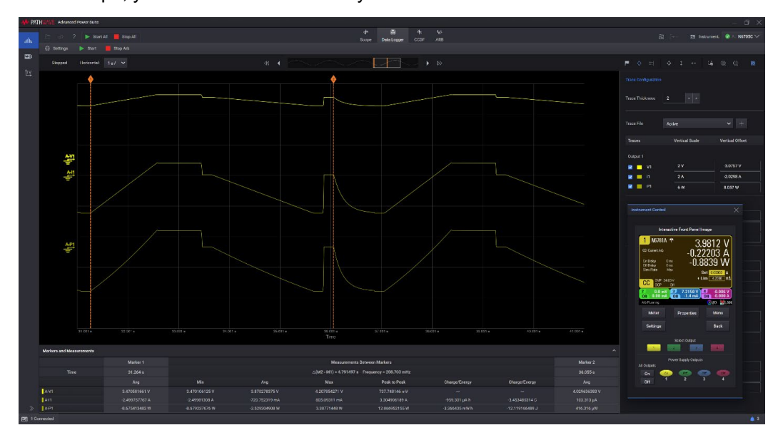
Figure 5. PW9252A in data logger mode

Setup short-term measurements using scope mode or long-term measurements using data logger mode to gain insights into your device's power consumption quickly and easily. If you know how to use an oscilloscope, you'll find the software easy and intuitive to use.