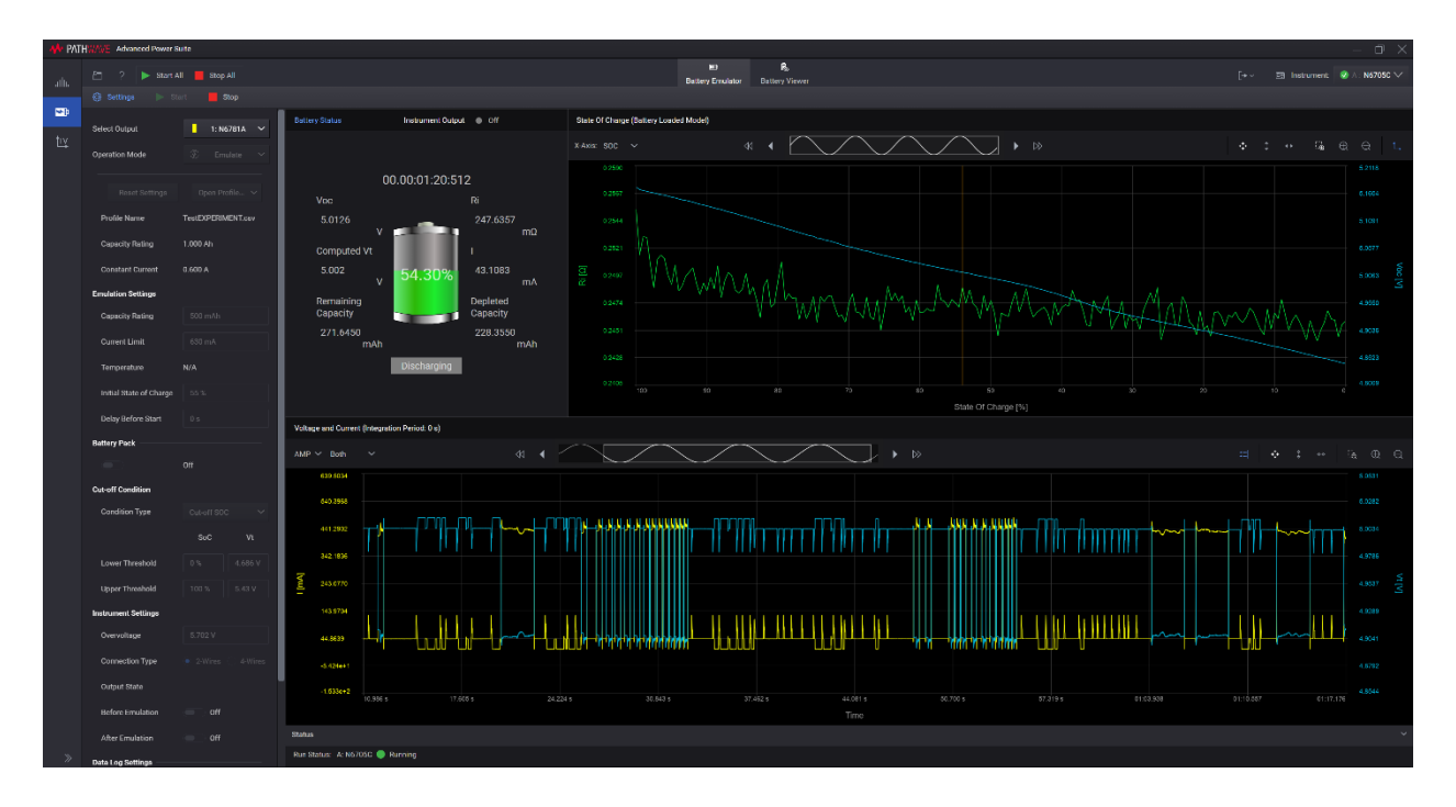
Figure 10. PW9254A Emulating Lithium battery powering a low power device