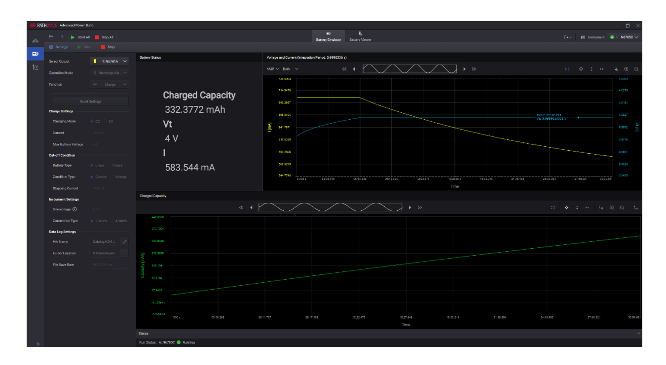
Figure 13. PW9254A Performing a battery charge on iron phosphate battery