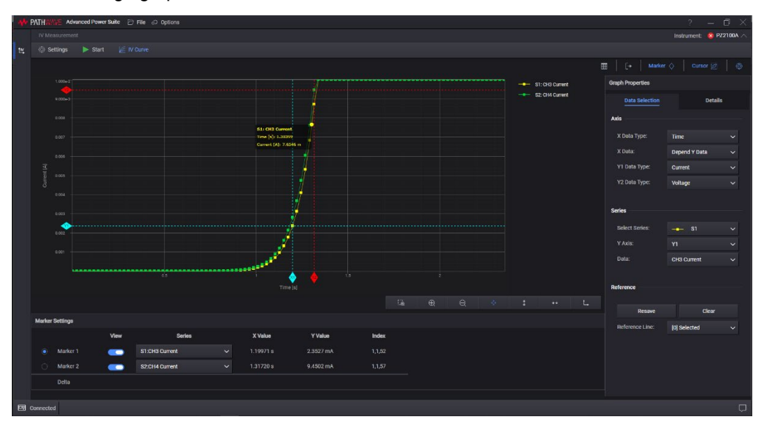
Figure 2. Reviewing test results through graphs with markers

The built-in graph function supports basic and advanced features, enabling immediate review of the test results through graphs with markers.