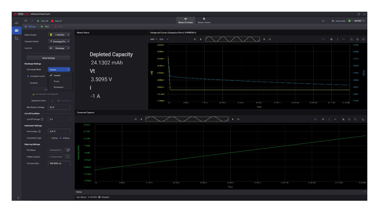
Figure 14. PW9254A enables you to choose various discharge mode option (constant current, power, resistance, and dynamic current discharge)