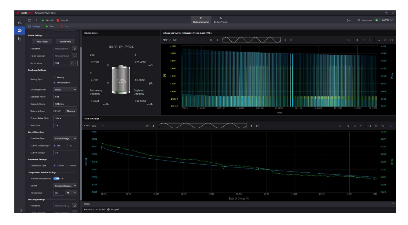
Figure 9. PW9254A creating a battery profiler with ambient temperature, constant power discharge features