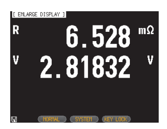
Simple Mode (R+V measurement parameters)

The GBM-3000 series offers two display modes to facilitate users in maximizing the benefits of their measurements – Standard mode: The main measurement parameters (three combinations: R+V/R/V) and parameter settings for the related measurements can be displayed